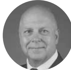
The Hon. Tim Pallas – Treasurer of Victoria

“We recognise that your expertise is something that we can be well-guided by and certainly it provides for informed policy.”