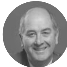
The Hon. Richard Wynne – Planning Minister of Victoria

“We recognise that your expertise is something that we can be well-guided by and certainly it provides for informed policy.”